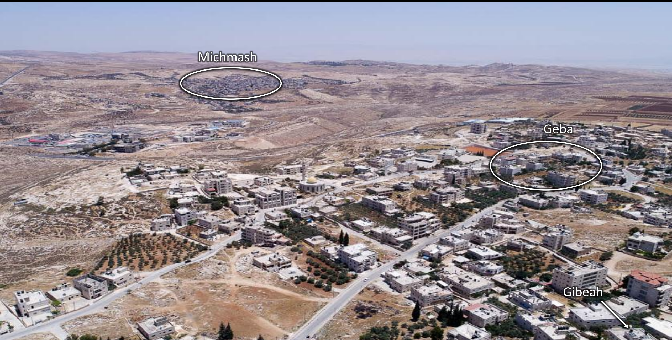
Geba, the Pass, and Michmash (aerial view from the southwest)

And Jonathan struck the garrison of the Philistines that was in Geba