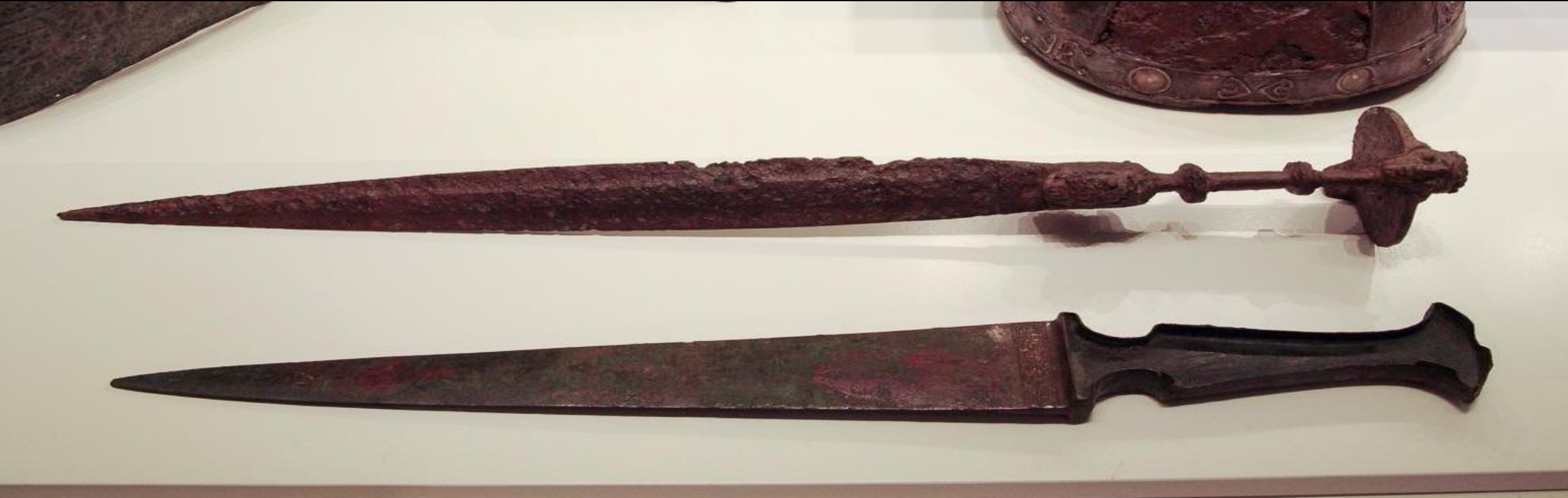
Iron sword (top), 9th–8th centuries BC; bronze sword (bottom), circa 1000 BC, from Luristan